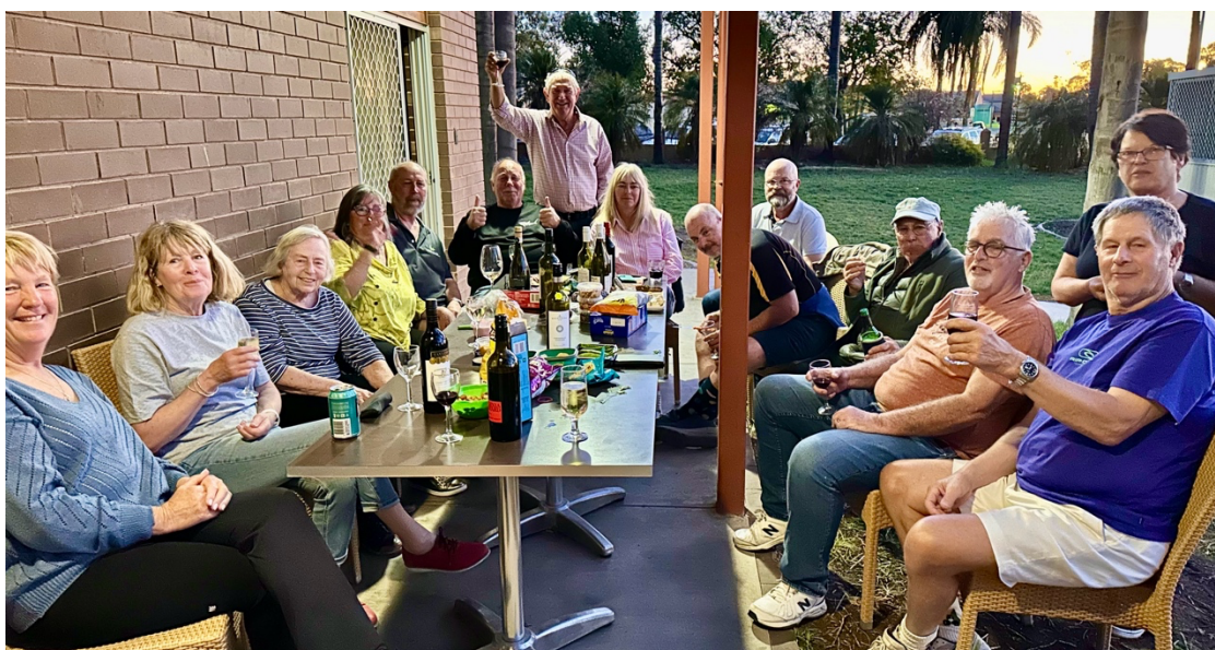
Bowlers having fun